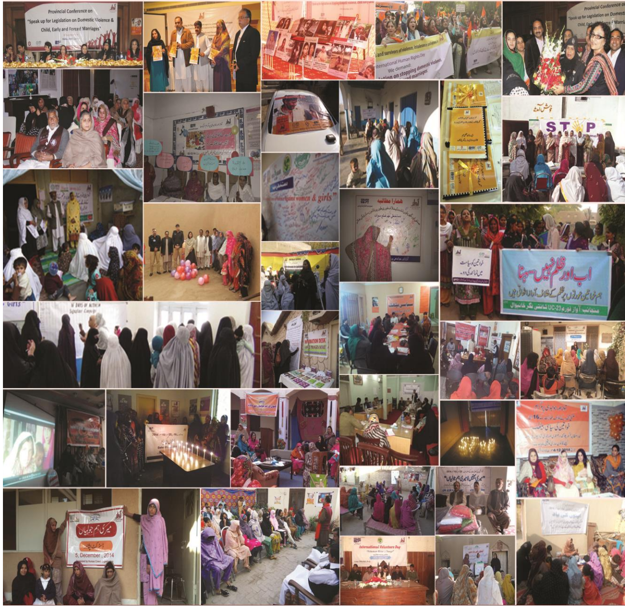
A glimpse of activities being conducted in various districts of AAWAZ Programme under commemoration of 16 days of activism